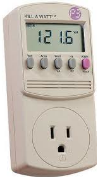
Kill a Watt Electricity Usage Monitor